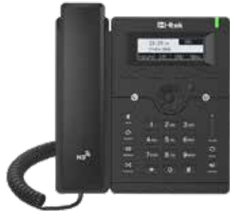
HTEK 902 - CLASSIC