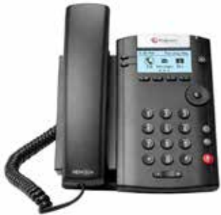
Polycom VVX 201 - CLASSIC