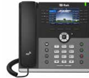
HTEK 926 - EXECUTIVE