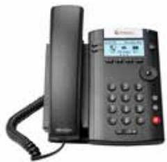
Polycom VVX 201 - CLASSIC