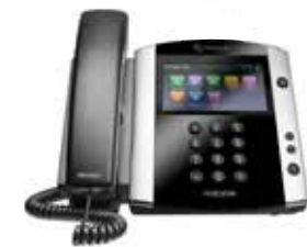
Polycom VVX 601 - EXECUTIVE