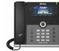
HTEK 926 - EXECUTIVE