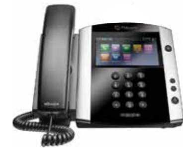
Polycom VVX 601 - EXECUTIVE