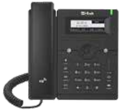
HTEK 902 - CLASSIC