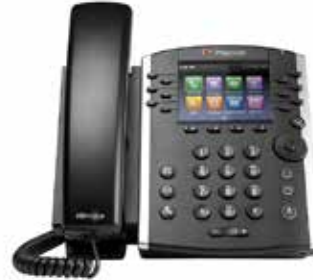
Polycom VVX 401 - ENTERPRISE