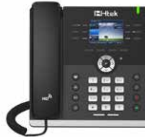
HTEK 923 - ENTERPRISE