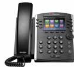
Polycom VVX 401 - ENTERPRISE