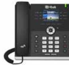
HTEK 923 - ENTERPRISE